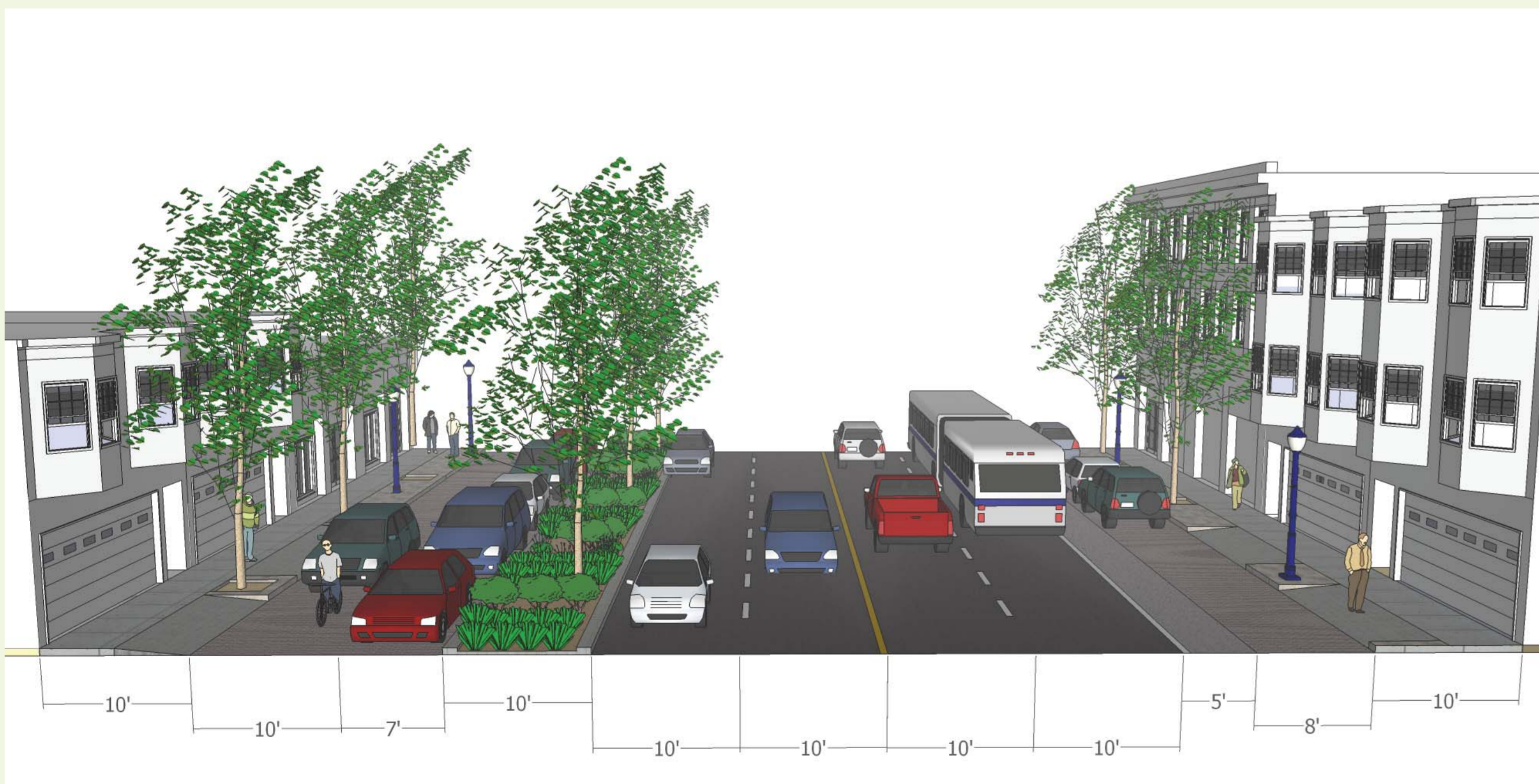
Option 2: Boulevard