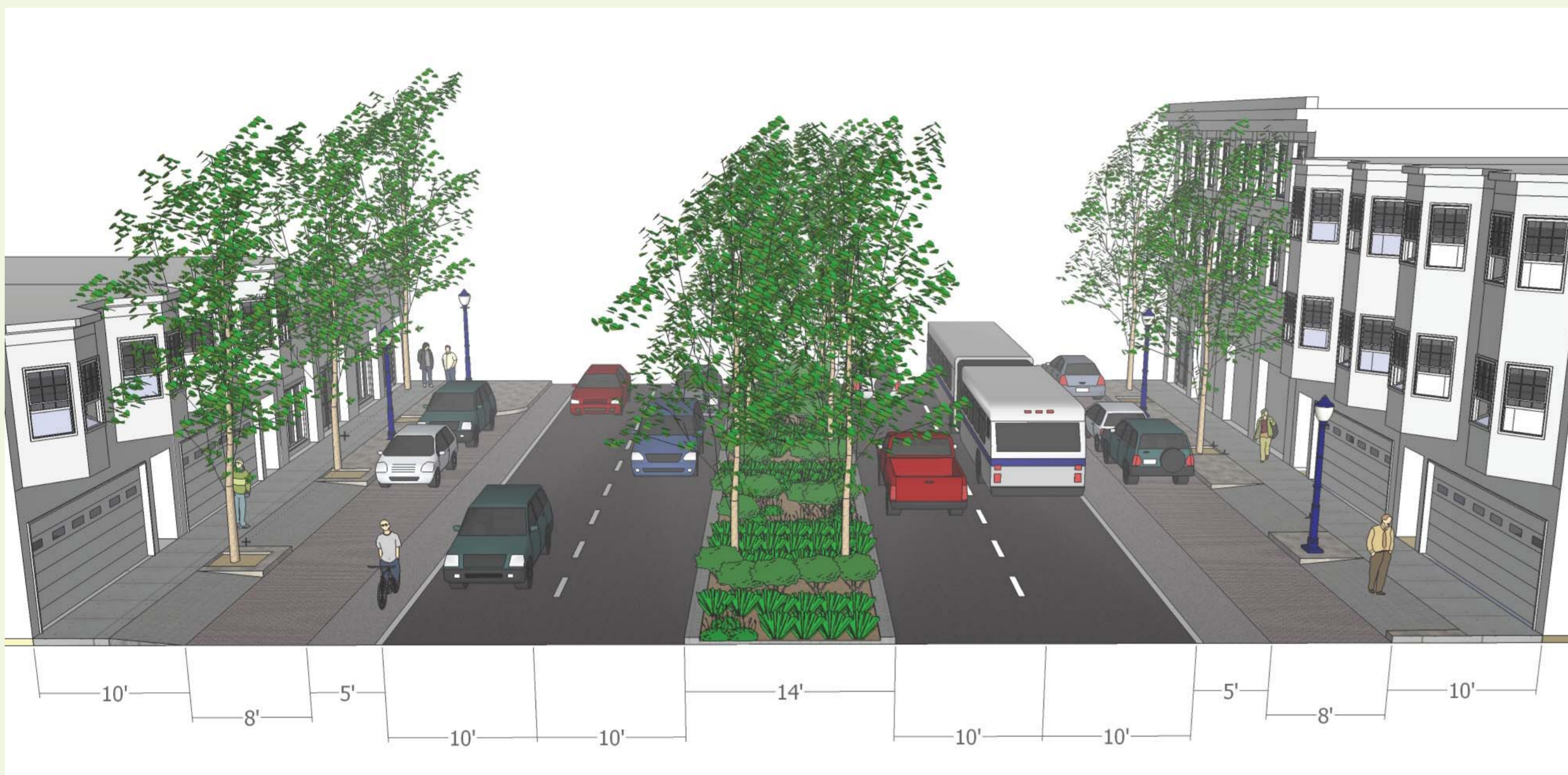
Option 1: Wide Median