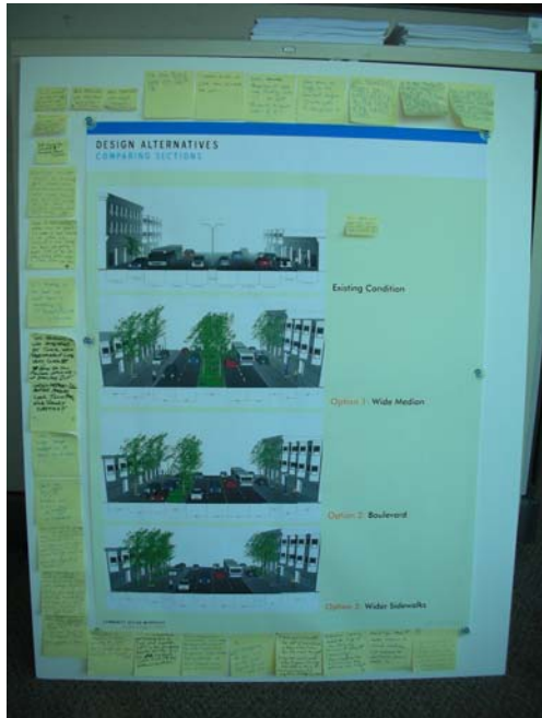
Design Alternatives, Comparing Sections