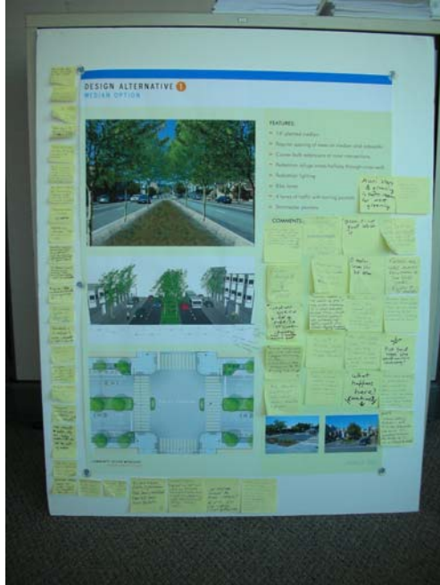
Design Alternative 1 – Median Option