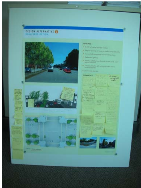
Design Alternative 2 – Boulevard Option