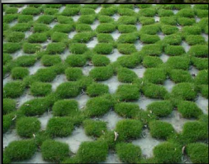
TURF BLOCK / "GREEN FUZZ"