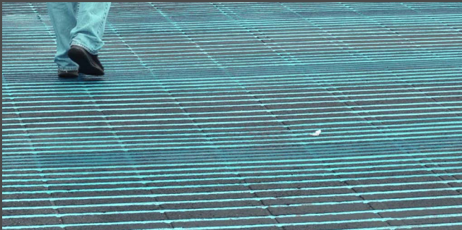
SPECIAL PAVING AT CROSSWALKS

January 2016 through October 2016 22ND ST CALTRAIN BRIDGE CONSTRUCTION