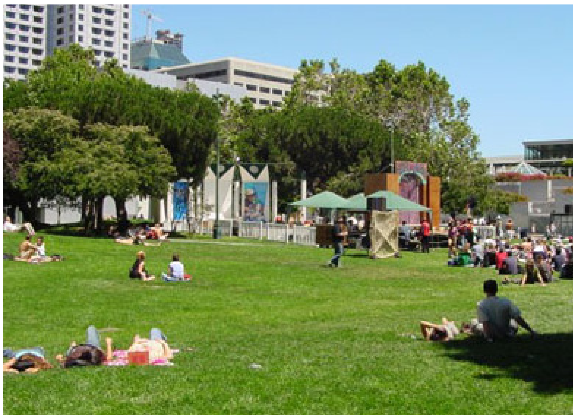
Picnicking Areas - Sitting in Grassy Areas