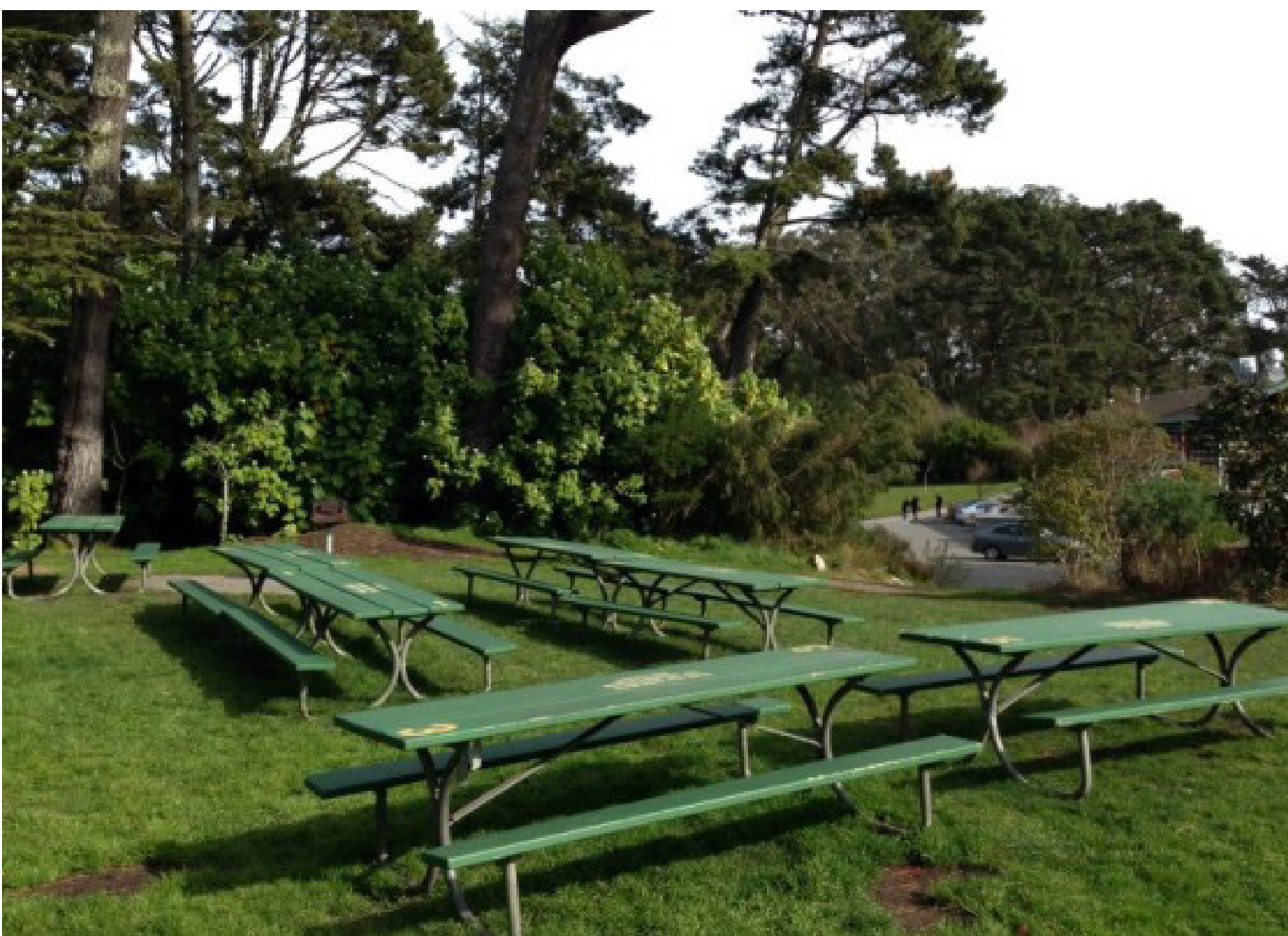
Picnicking Areas - Benches and Tables