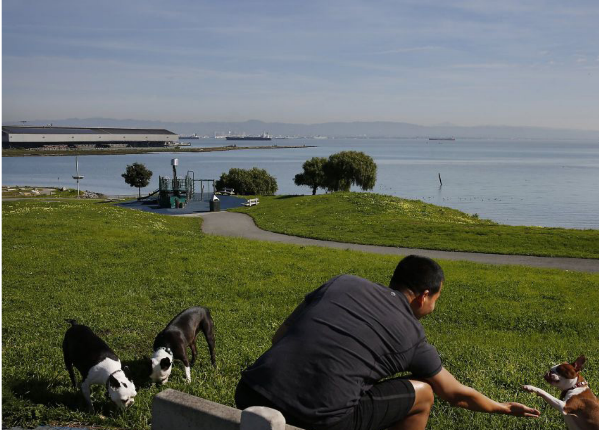
Shoreline access and views