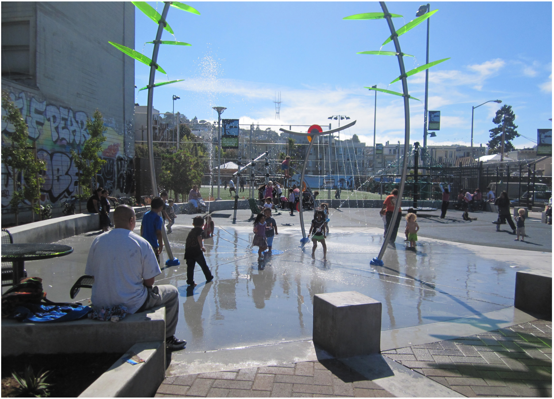
Childrens Play Areas - Outdoor with Water Feature