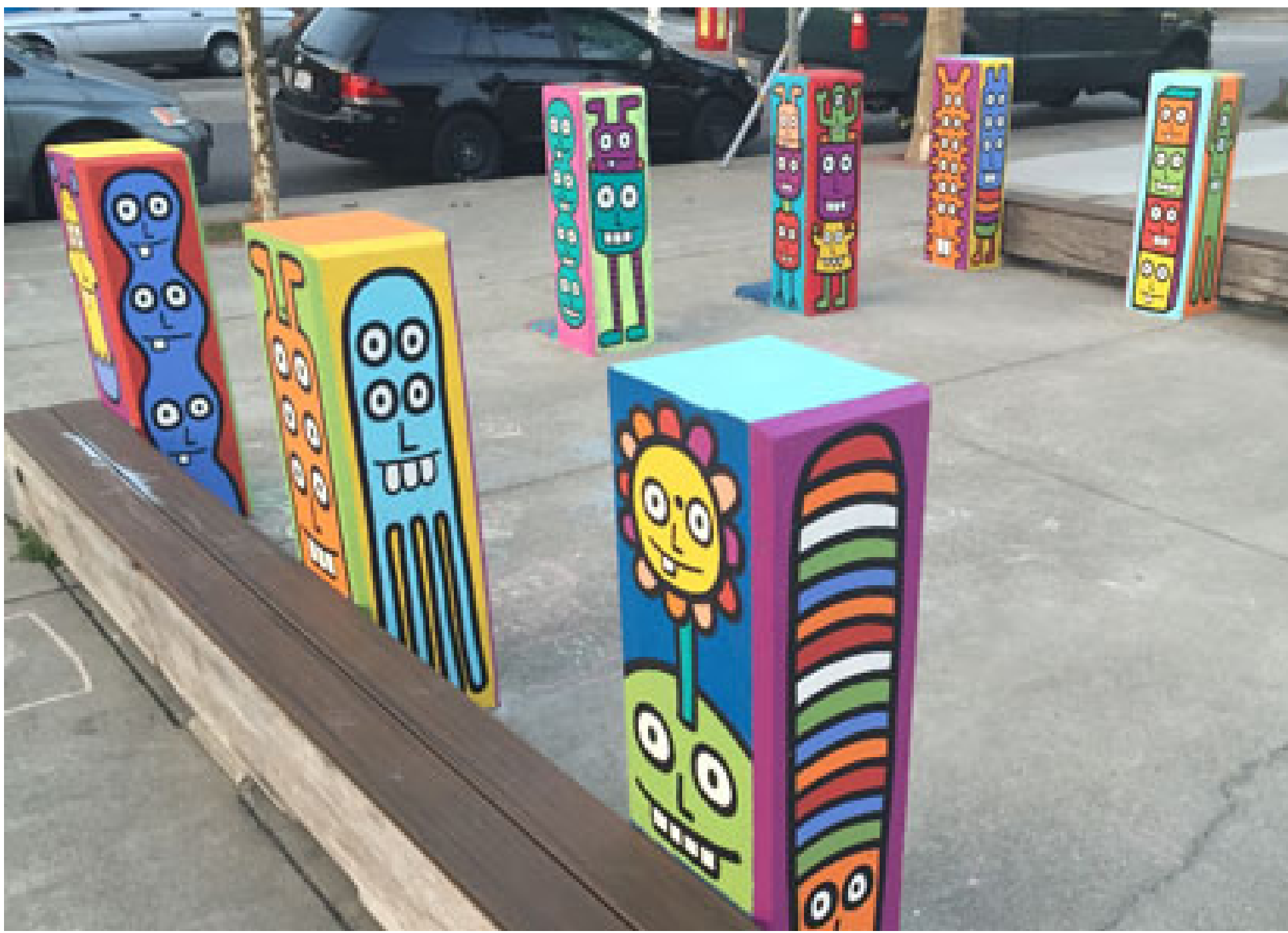
Art and Sculpture