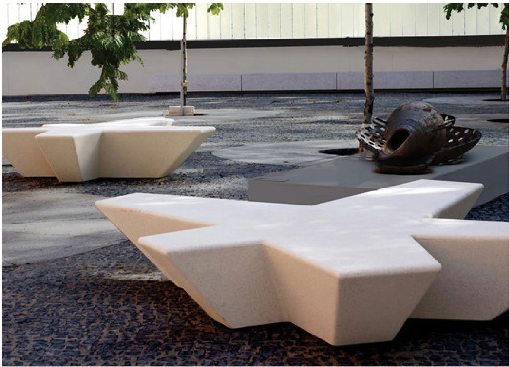
Benches and Seating