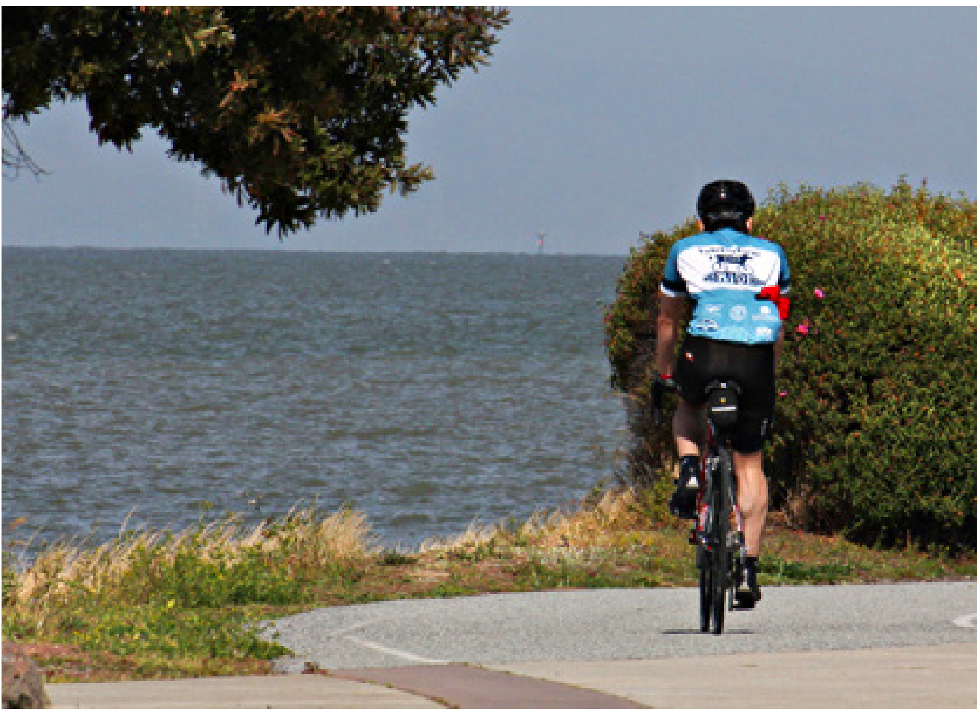
Urban Trails - Walking, Hiking, Jogging, Biking