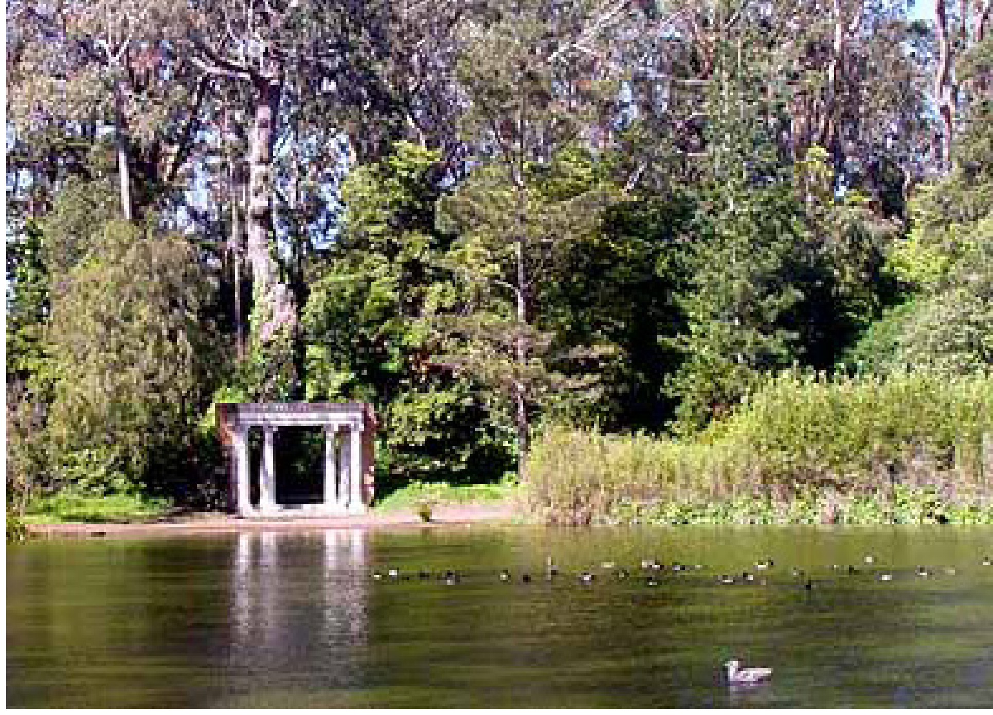
Water Bodies or Water Features