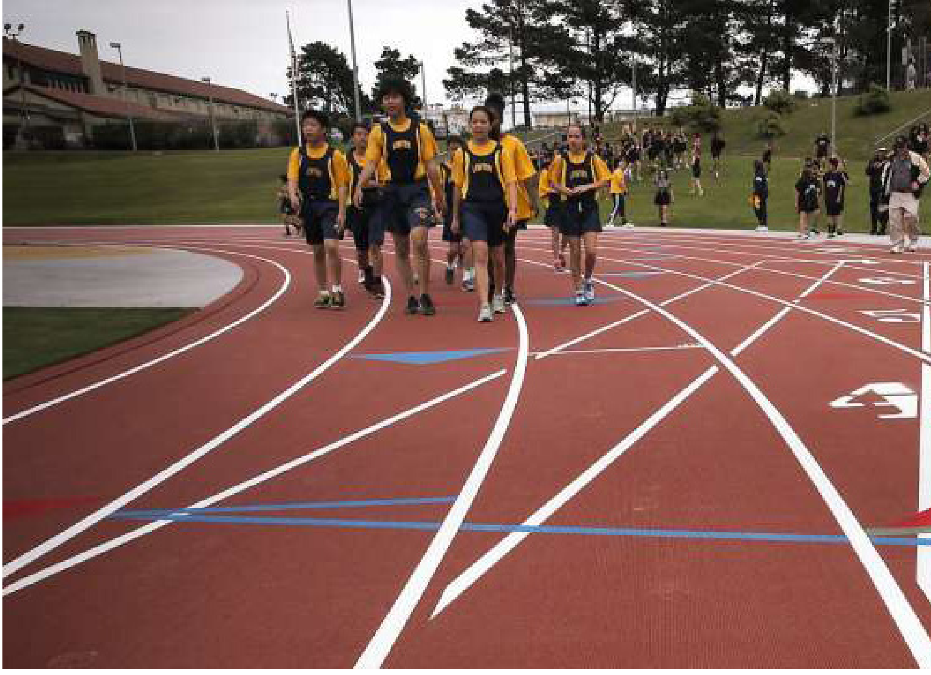
Athletic courses and outdoor athletic equipment