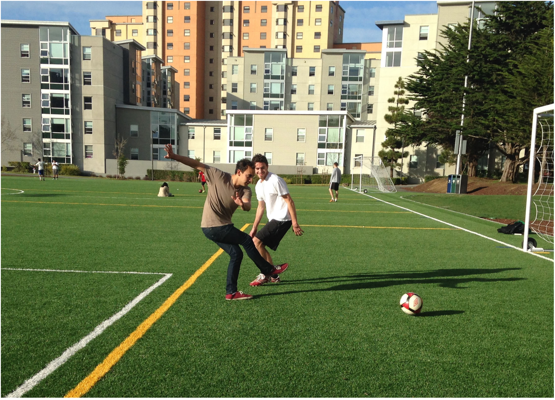
Field Sports - Soccer, Football, Baseball, Softball, Tball