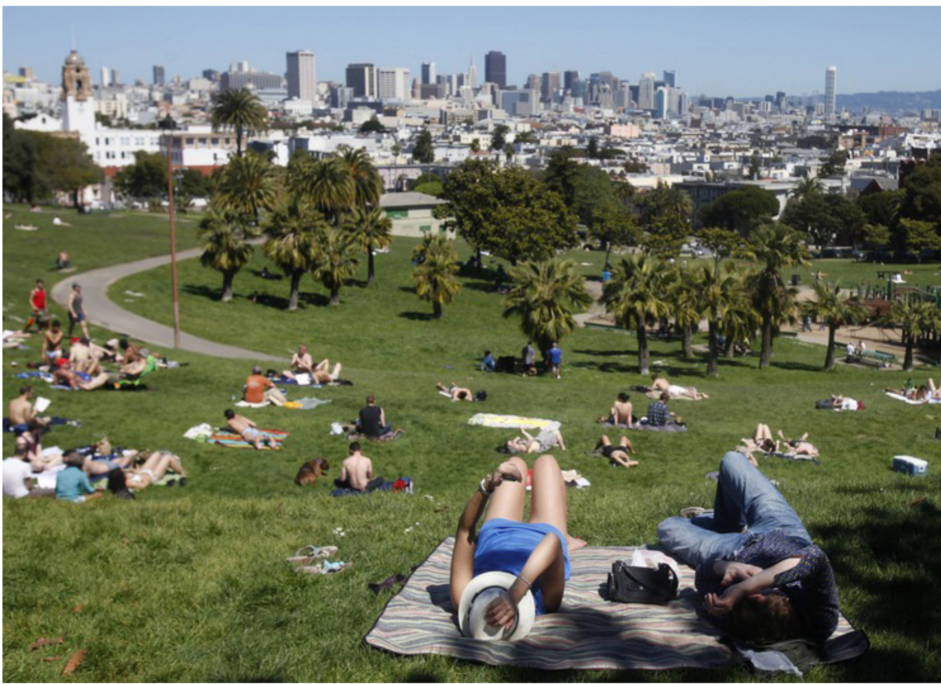
Areas to simply sit and observe people outside