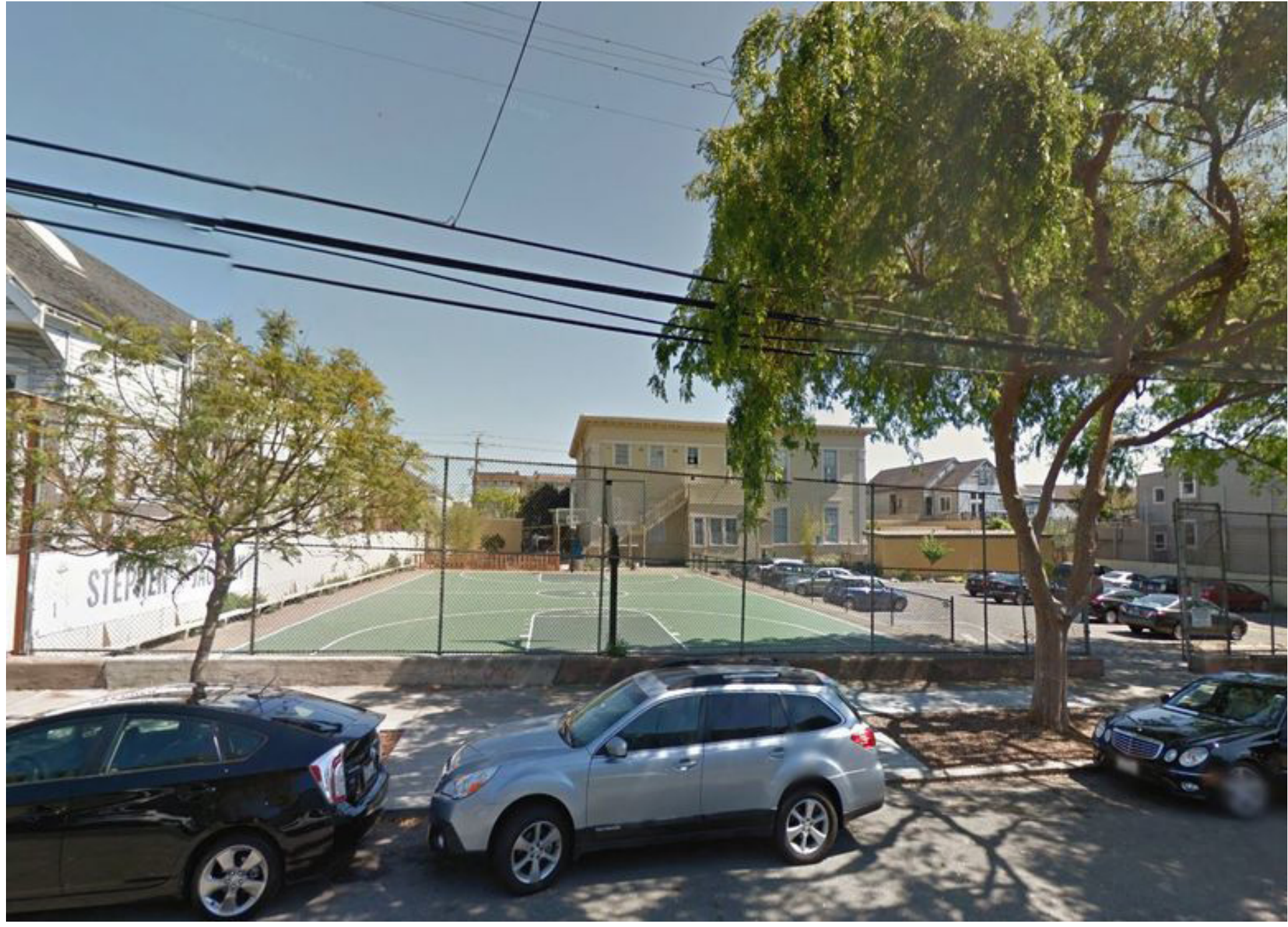
Court Sports - Basketball, Handball, Racquetball, Tennis