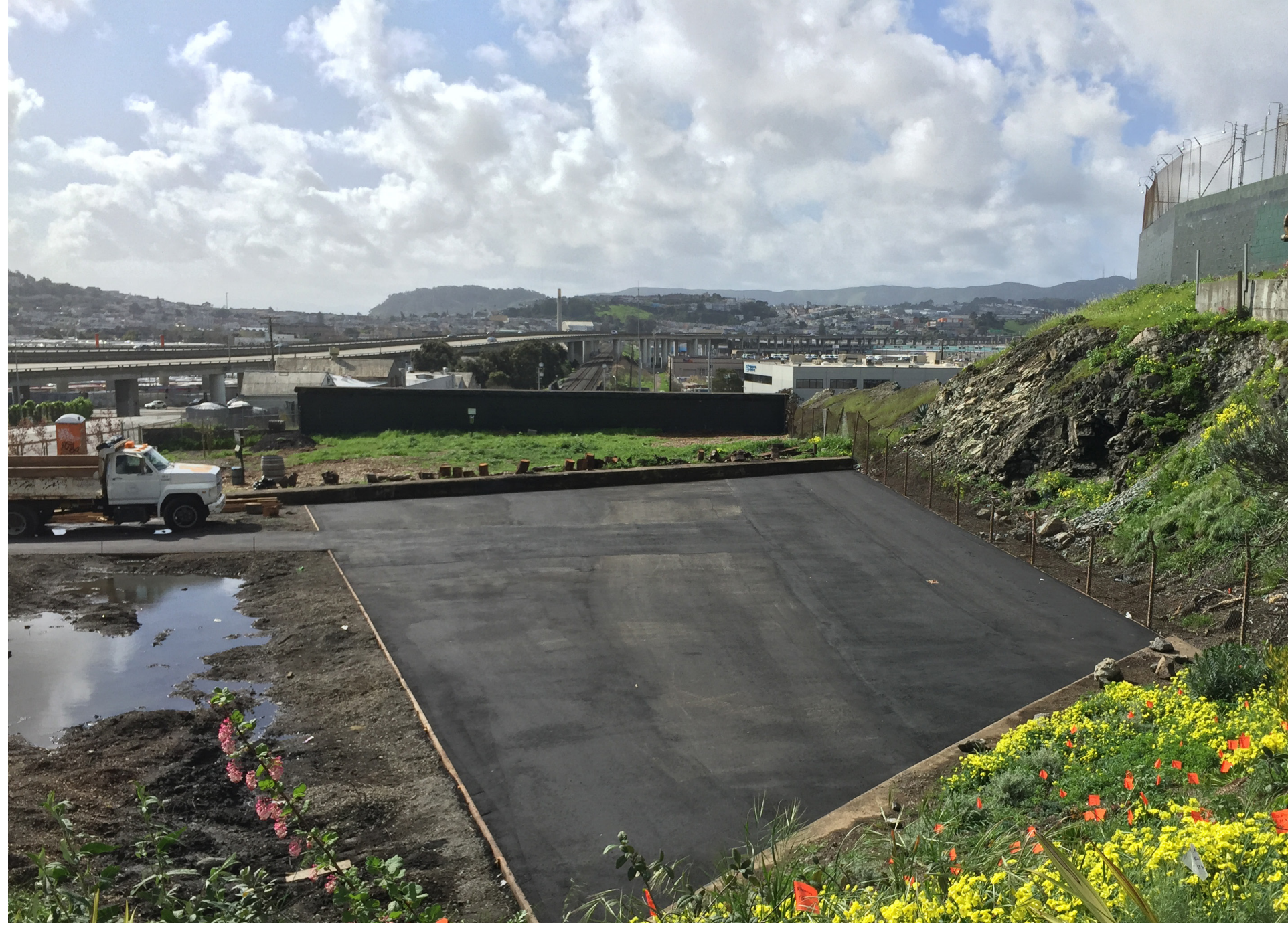
Hilltop / Ridge access and views