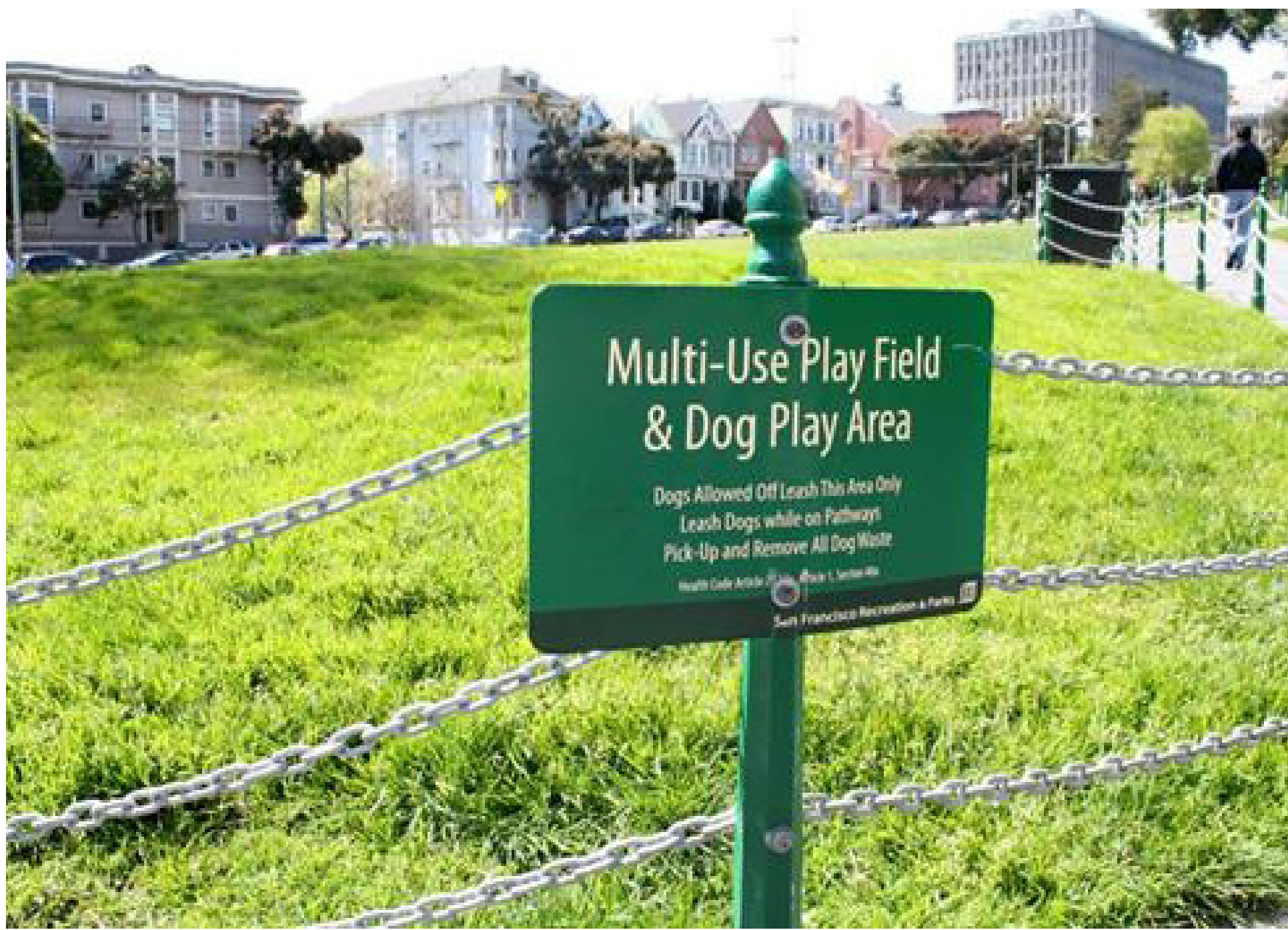
Dog Runs or Dog Areas