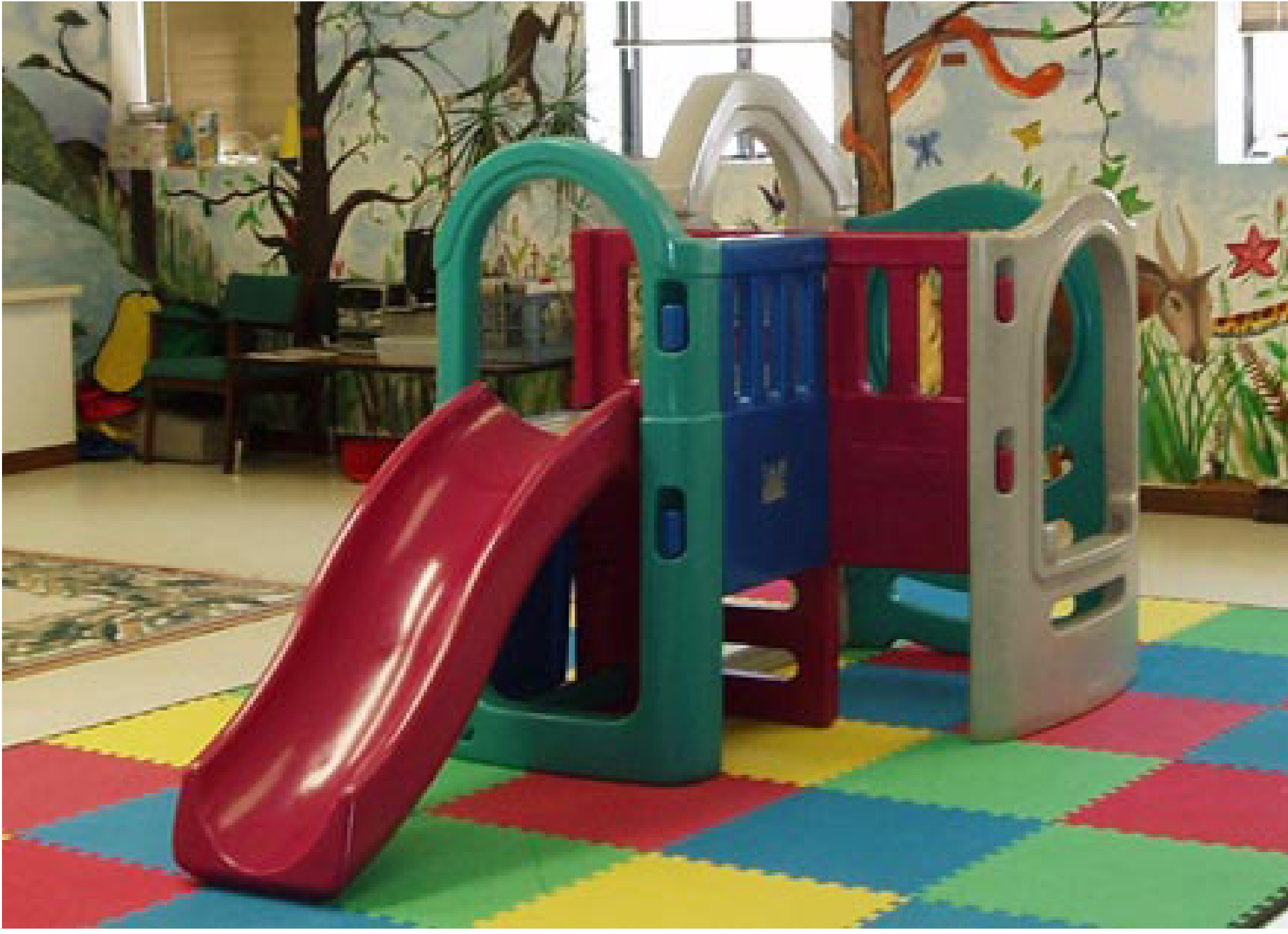
Childrens Play Areas - Indoor with Structures