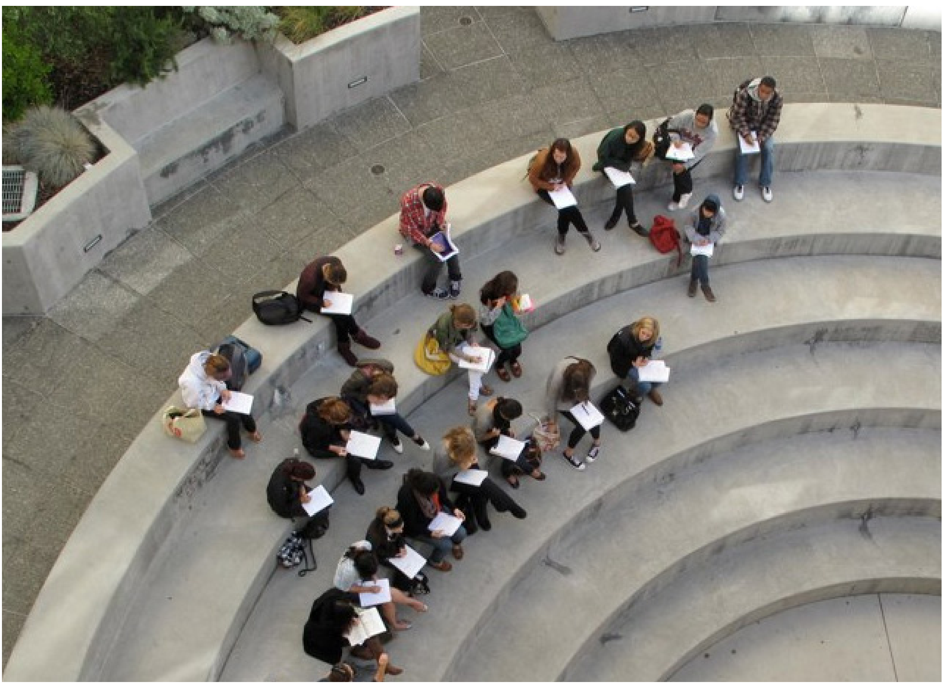
Venues Outdoors - Gazebos, amphitheaters, plaza areas