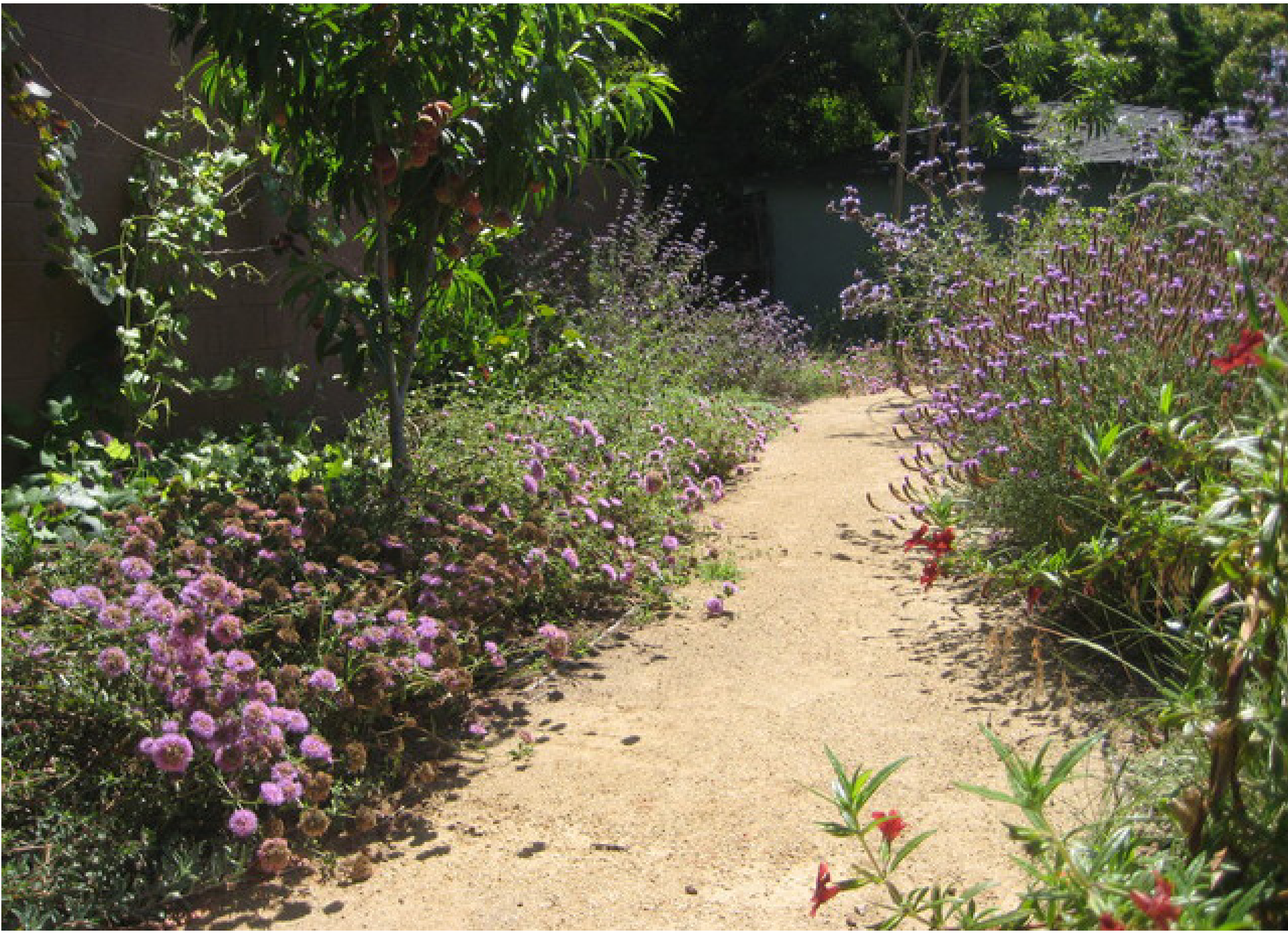
Ecological Landscaping - Bioswales, Habitat Gardens, etc