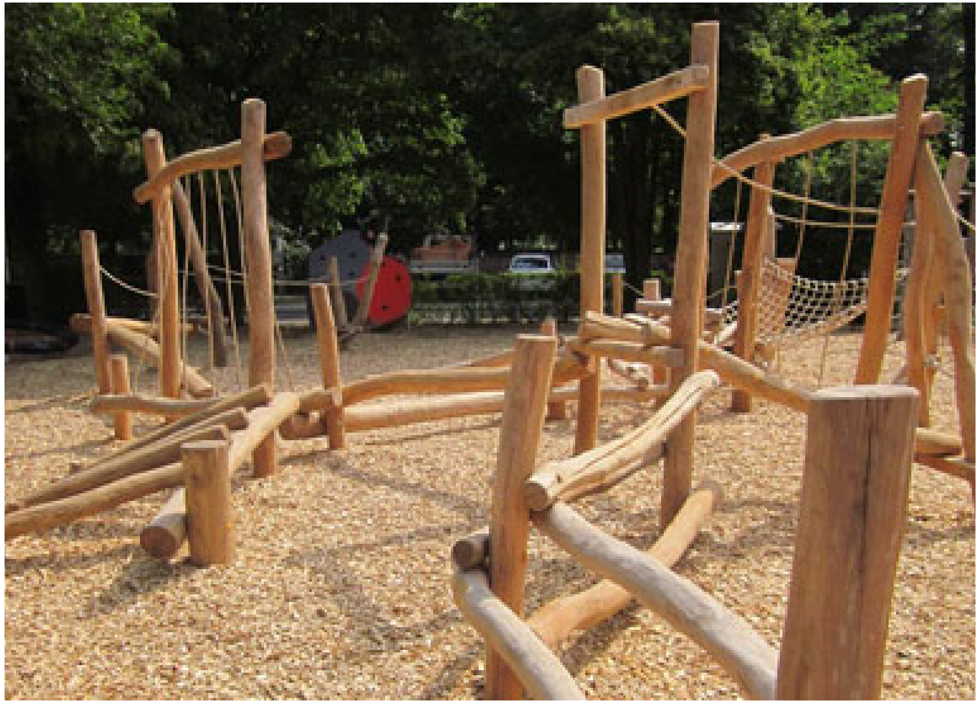
Childrens Play Areas - Outdoor with Structures