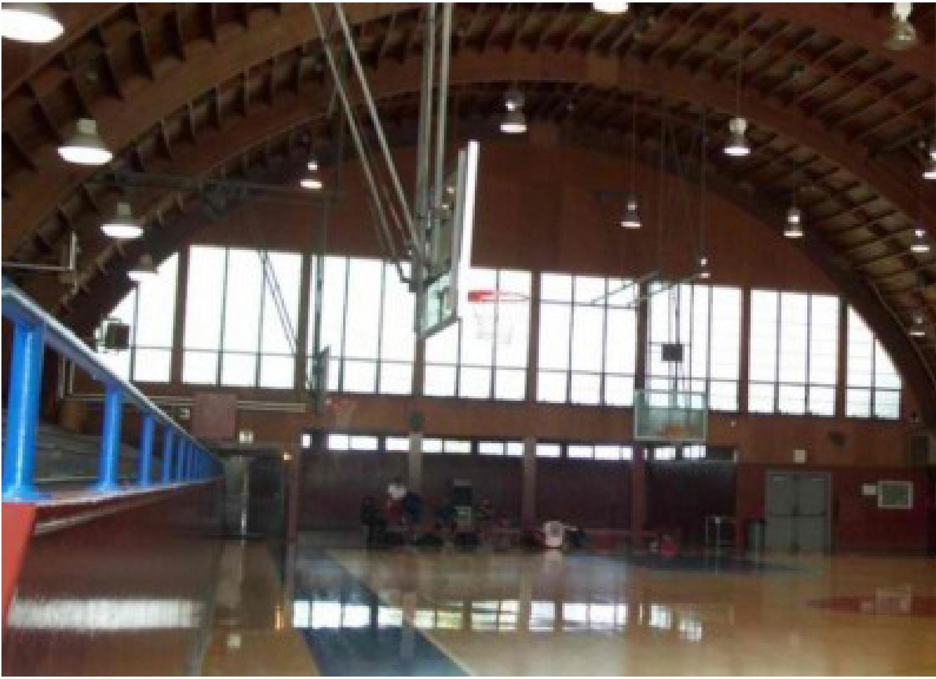
Venues Indoors - Recreation and Multipurpose Rooms, Gym Spaces