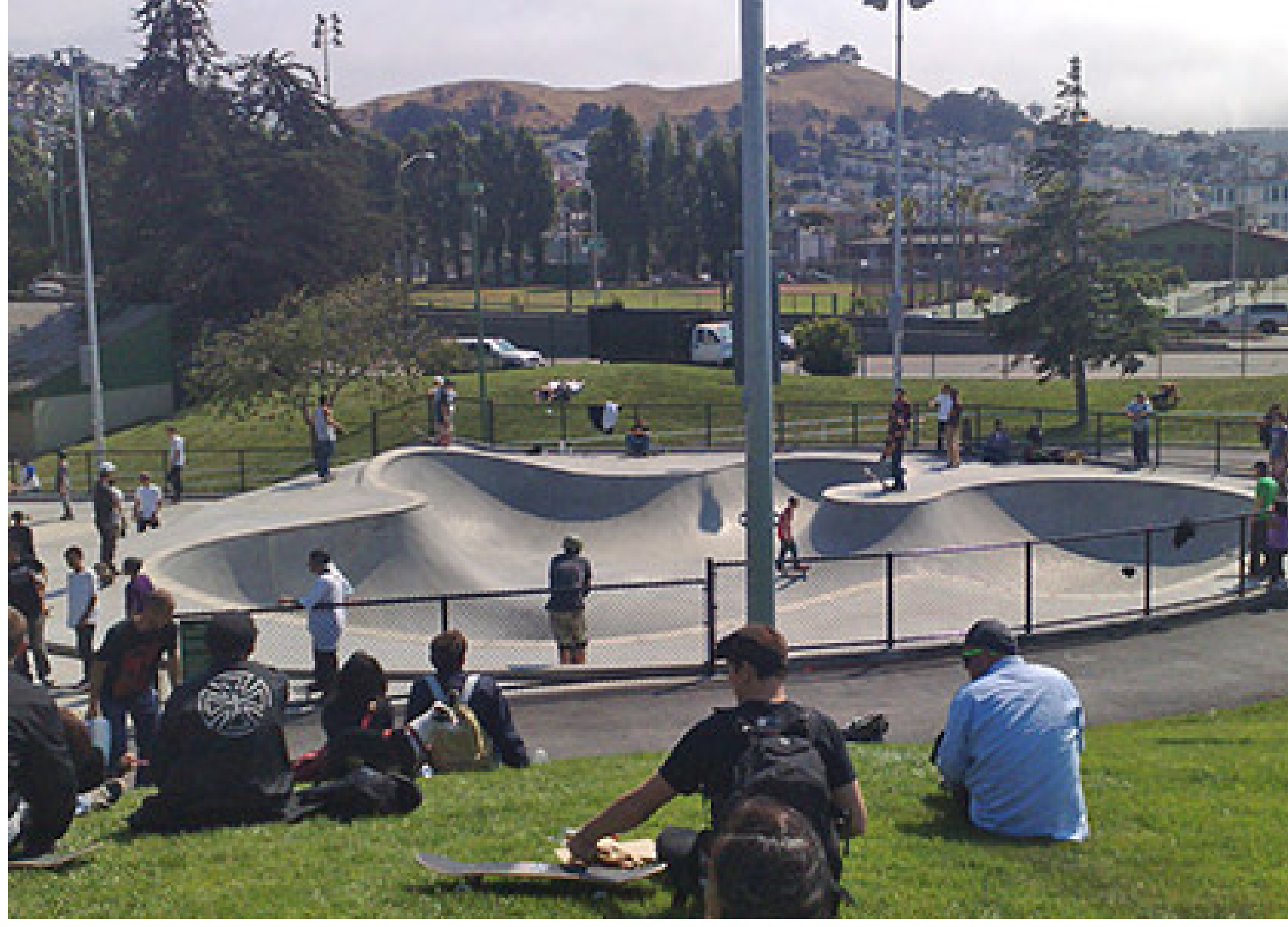
Skatepark and/or Bicycle Course