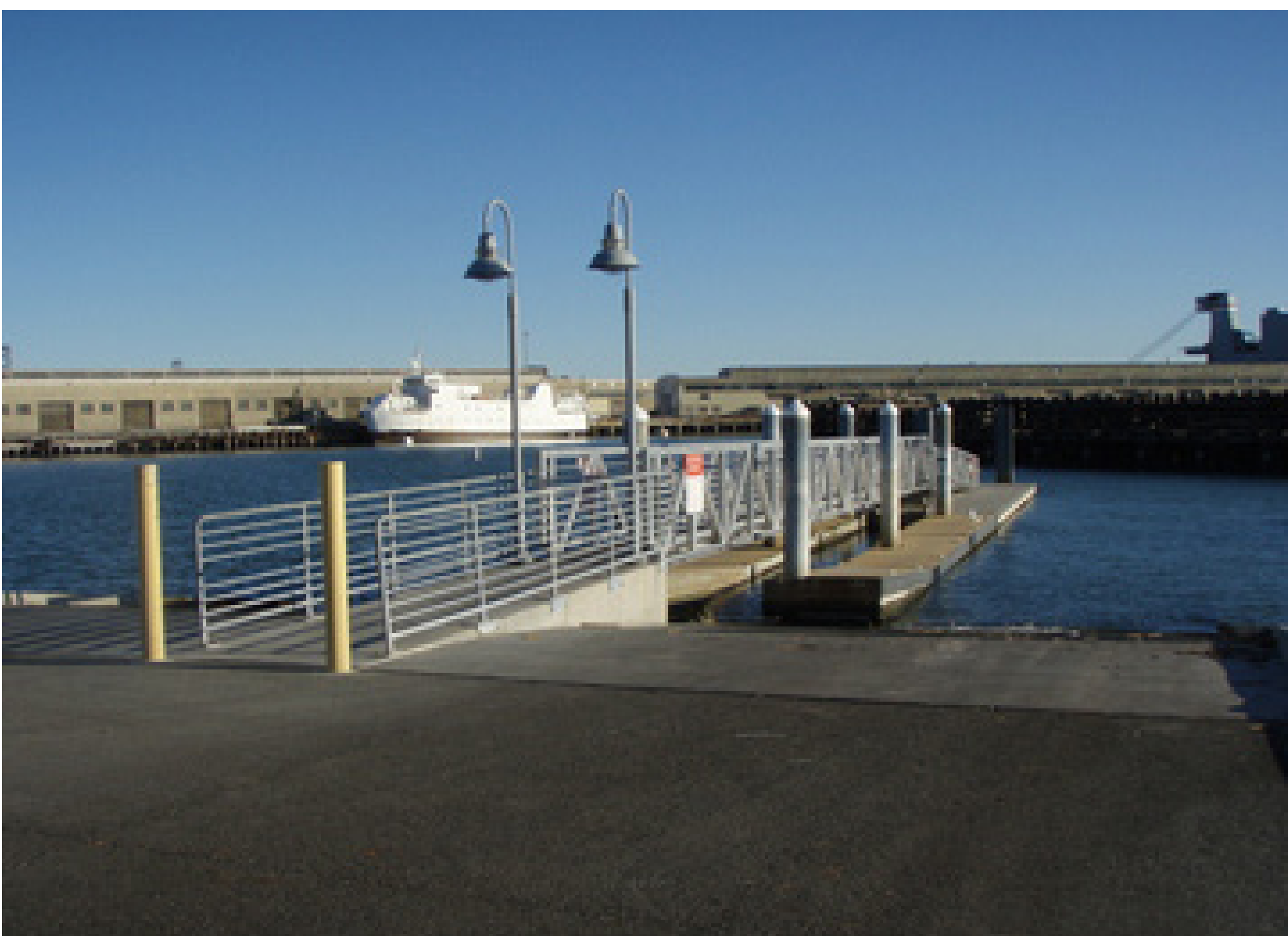
Boat Facilities - dock, launching ramp, marinas