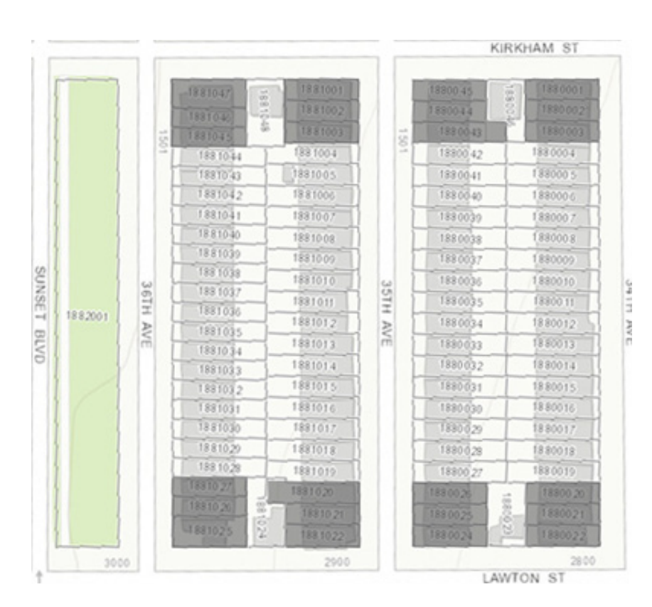
Properties with visible rear facades are shaded.

C of A : For exterior alterations requiring a building permit, with the exception of identified scopes of work that qualify for "No C of A" or an "Admin C of A." Examples of alterations that require a C of A include visible horizontal or vertical additions.