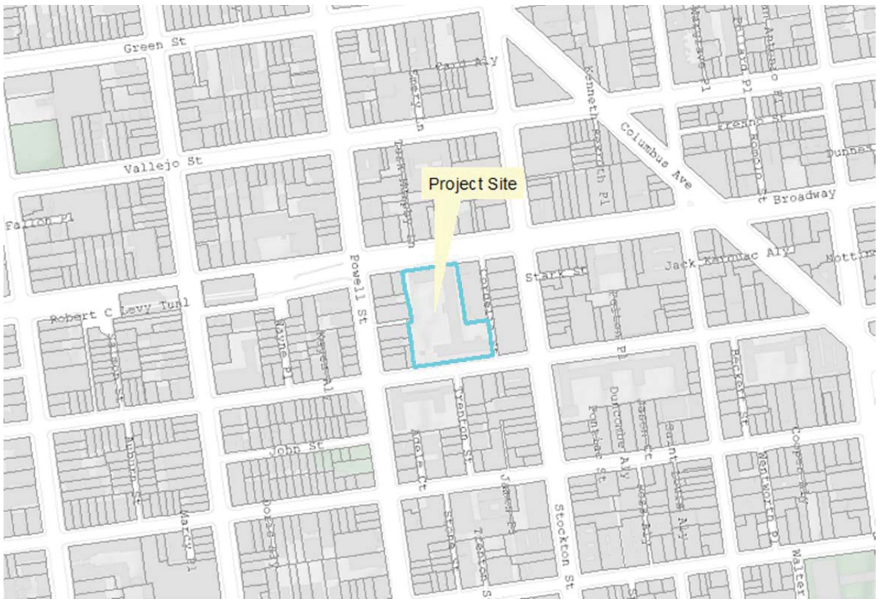
Figure 1: Project Location